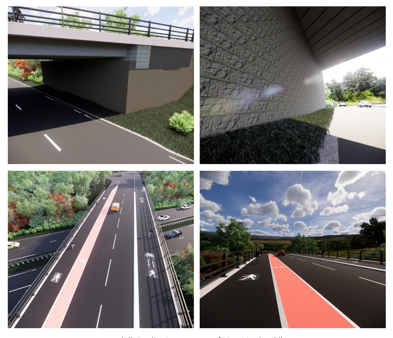
(All visualisations courtesy of Mott Macdonald)